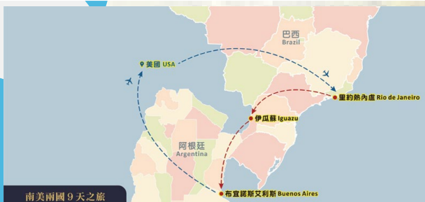
南美兩國 9 天之旅

website- www.sonictour.com CONTACT NUMBER-323-266-8988