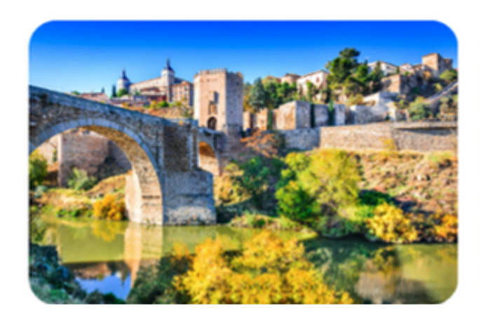
DAY 5 Madri - Toledo - Granada

Hotel: Eurostars Suites Mirasierra 5* or similar