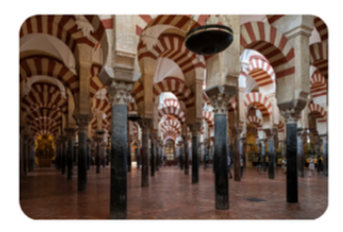
DAY 6 Granada - Cordoba - Seville