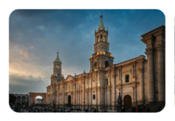
DAY 7 Sylvia - Lisbon

Hotel: Eurostars Torre Sevilla 5*or similar