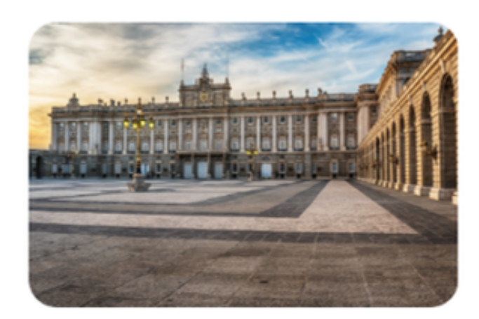
DAY 4 Barcelona – AVE Highspeed rail train (2nd Class)– Madrid [Refer to the high-speed rail time: 9:50A/12:35P]

Hotel: Hotel Exe Plaza Catalunya 5* or similar