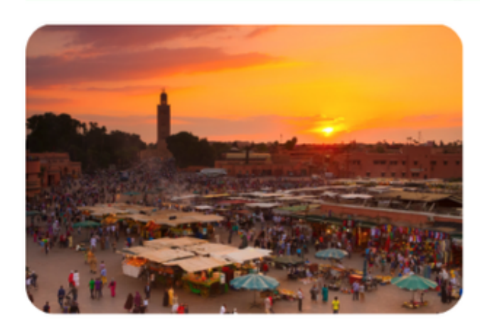
DAY 9 Lisbon + Marrakesh [Refer to the flight 2:40P/4:20P]

Hotel: Eurostars Das Letras 5* or similar