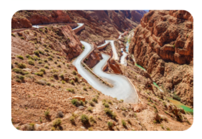
DAY 11 Quarazate – Merzouga

Breakfast: Hotel Buffet | Lunch: Local Cuscus Cuisine | Dinner: Local Dinner Hotel:Oscar Hotel By Atlas Studios 4* or similar