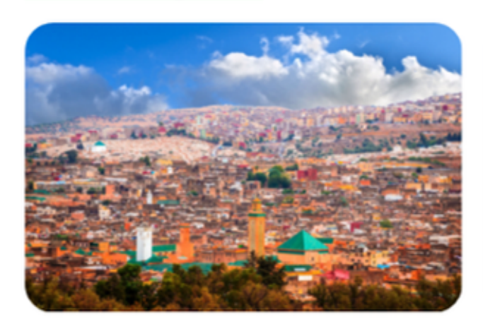
DAY 12 Merzouga – Fes

Hotel: Caravanserai Luxury Desert Camp or similar