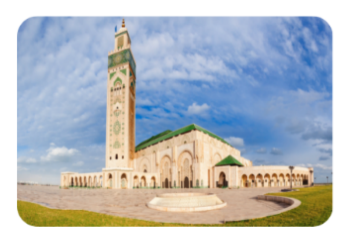
DAY 14 Chefchouen – Casablanca

Breakfast: Hotel Buffet|Lunch: Local Cuisine|Dinner: Exquisite dinner at the hotel Hotel: Hotel Parador or similar hotel or the same level of characteristic homestays